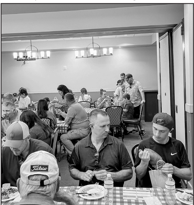
The Mountain Masters Jr Golf league hosted its banquet at the Union County Community Center last Thursday, Oct. 11.