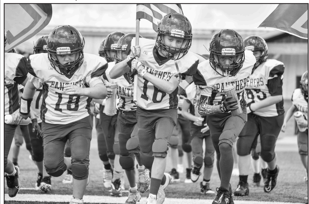
Union County's 4th grade team is 3-2 on the year and sitting in third place in the Mountain Athletic Conference ahead of Saturday's showdown with 4th-place Gilmer.